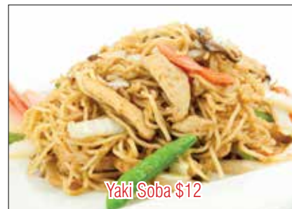
Yaki Soba $12