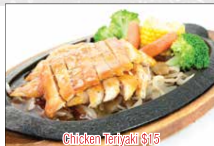
Chicken Teriyaki $15