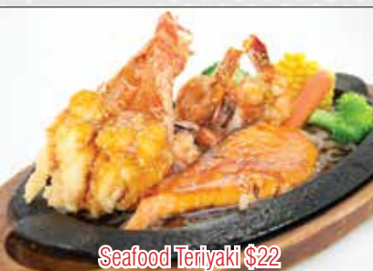
Seafood Teriyaki $22