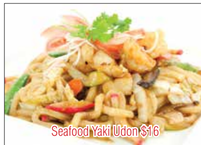
Seafood Yaki Udon $16