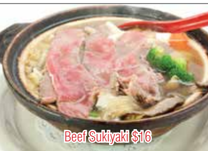
Beef Sukiyaki $16