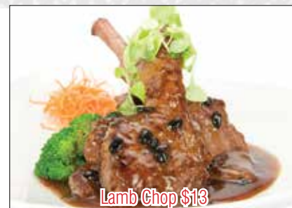
Lamb Chop $13