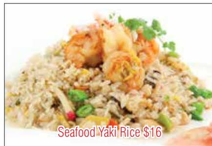
Seafood Yaki Rice $16