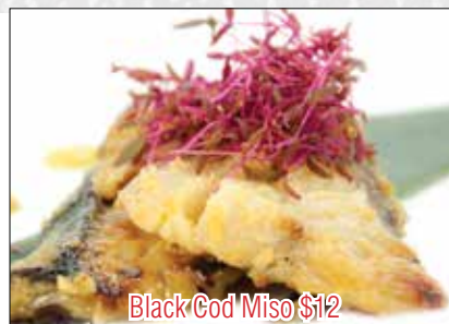
Black Cod Miso $12